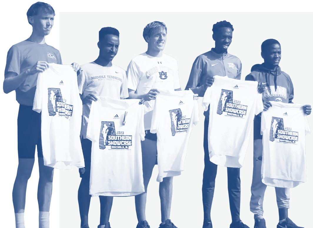
IMAGE RIGHT: Men's Top 5 Winners Southern Showcase at John Hunt Park